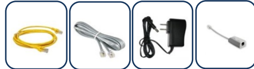
Ethernet Cord Phone Cord Power Adapter Phone Filter